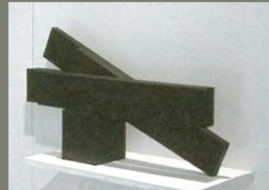
Minimalist Sculpture, 1974